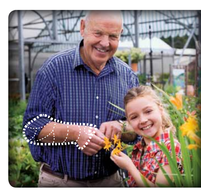
The only technology approved by the FDA to accelerate healing of indicated* fresh fractures and bones that won't heal on their own.<sup>3,7</sup>